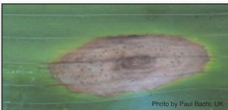
Figure 2. Close-up of Diplodia leaf streak of corn, showing black fungal fruiting bodies called "pycnidia". These are visible with a hand lens.