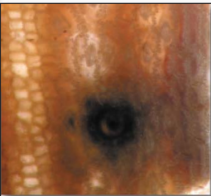
Figure 3. (Top Right) Close-up of fruiting body (called a "pycnidium") of Stenocarpella macrospora .