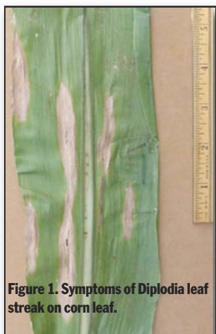
Figure 1. Symptoms of Diplodia leaf streak on corn leaf.

Diplodia leaf streak is certainly a disease to be on the watch for, especially since it can