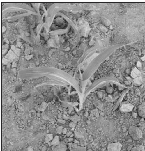
(Far Right) Figure 1. Fomesafen carryover on corn leaves appears as a clearing of the veins, known as veinal chlorosis.

The most common corn injury symptom caused by fomesafen carryover is a whitening of the leaf veins, commonly referred to as veinal chlorosis (Figures 1 and 2). Affected areas of corn leaves